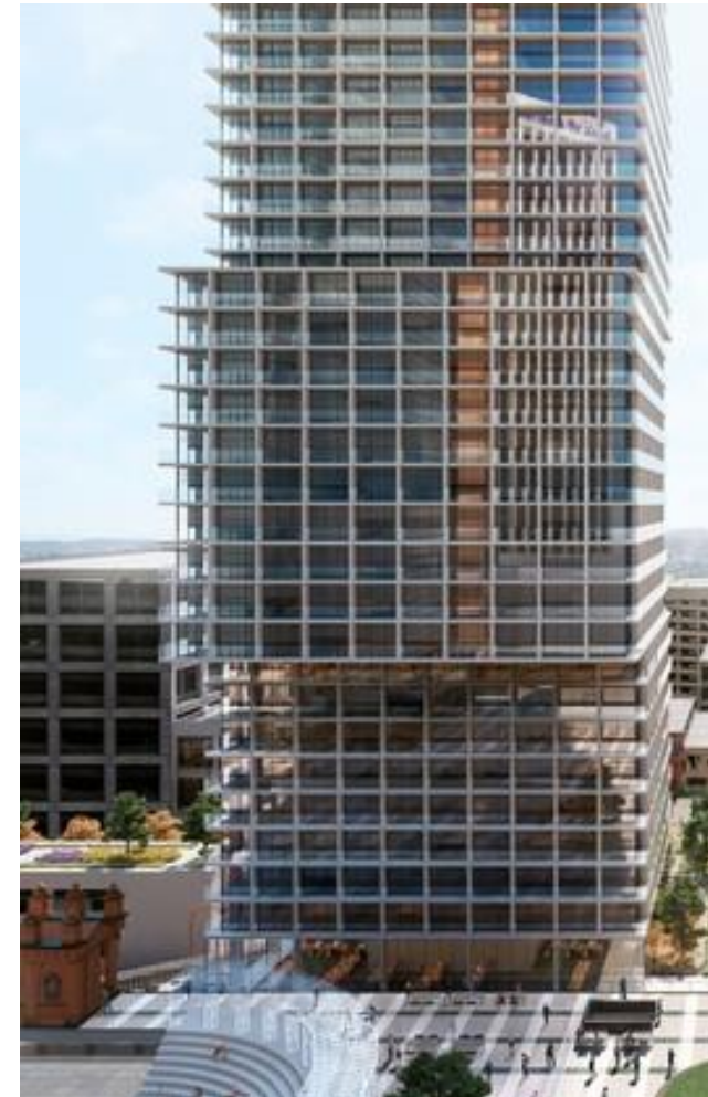
SOM Los Angeles